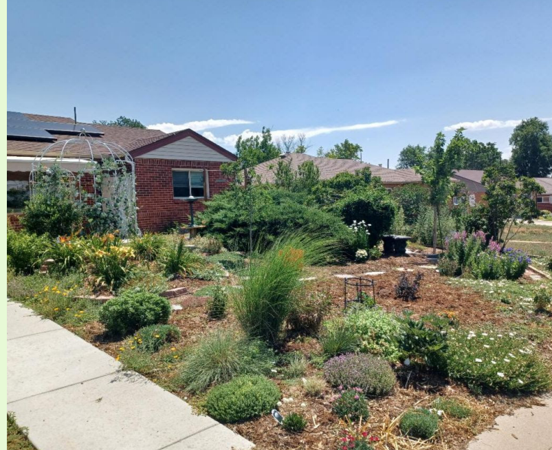
After landscape conversion: a colorful water-wise perennial garden in a bed of fresh mulch.