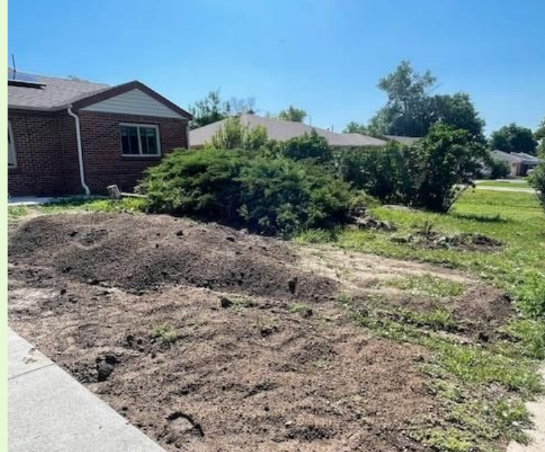
During landscape conversion: soil preparation for a new perennial garden.